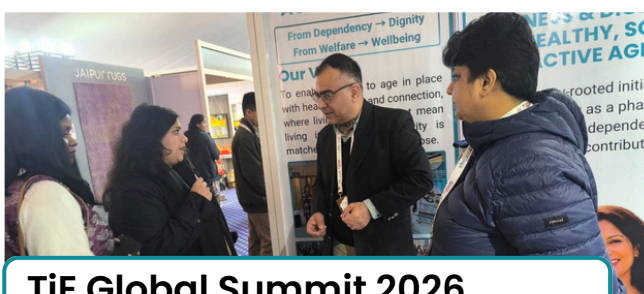
TiE Global Summit 2026