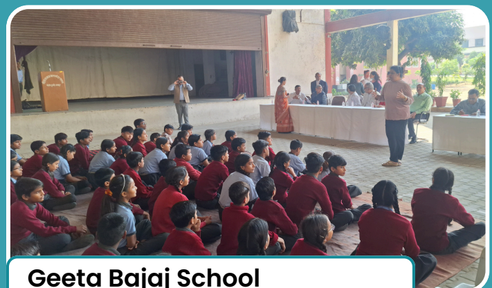
Geeta Bajaj School