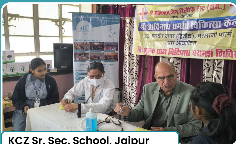
KCZ Sr. Sec. School, Jaipur