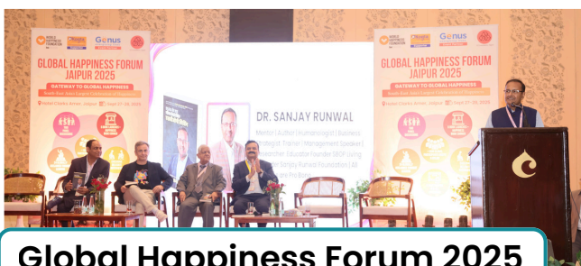
Global Happiness Forum 2025