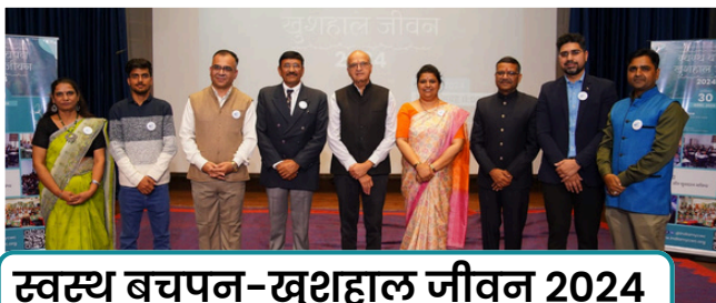
स्वस्थ बचपन-खुशहाल जीवन 2024