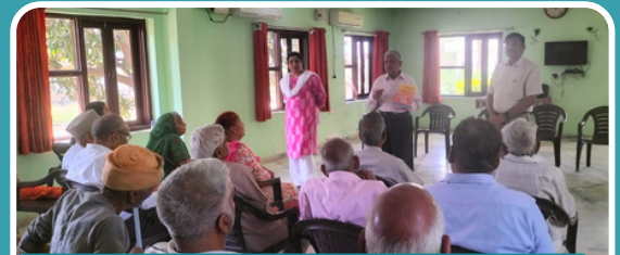
Jeevan Jyoti Vridh Ashram, Jaipur