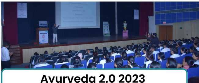
Ayurveda 2.0 2023