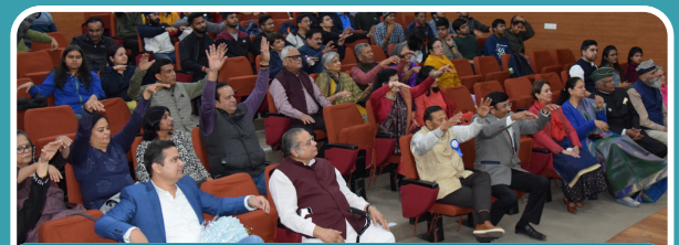
MNIT University, Jaipur