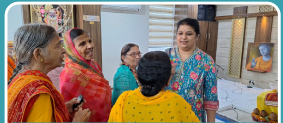
Krishna Dham Vridh Ashram, Jaipur