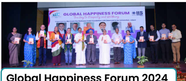
Global Happiness Forum 2024