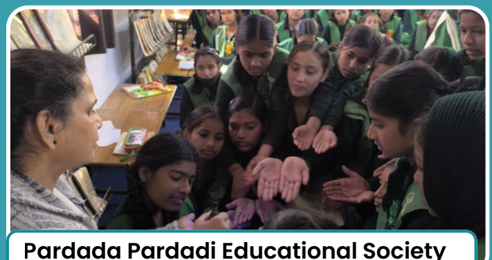
Pardada Pardadi Educational Society