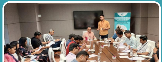
NAV India, Sitapura, Jaipur