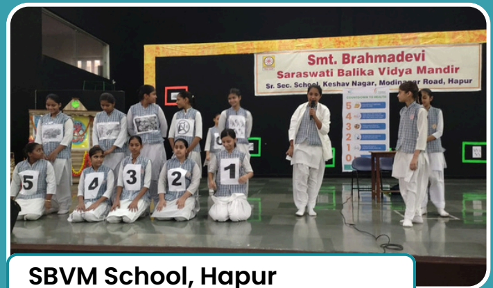
SBVM School, Hapur