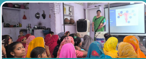
Manpura Machedi, Jaipur