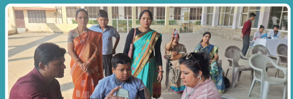
Geeta Bajaj School